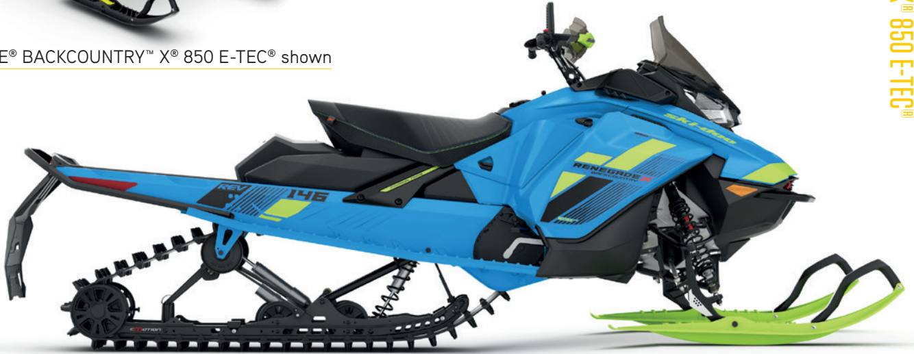
RENEGADE® BACKCOUNTRY™ X® 850 E-TEC® shown