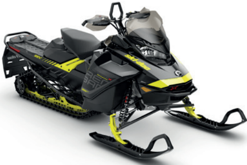
RENEGADE® BACKCOUNTRY™ X® 850 E-TEC® shown