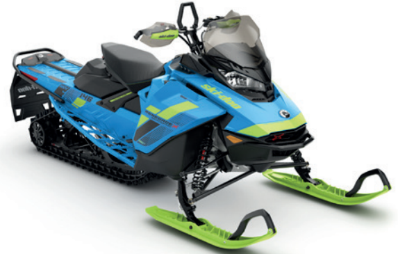
RENEGADE ® BACKCOUNTRY ™ X ® 850 E-TEC ® shown